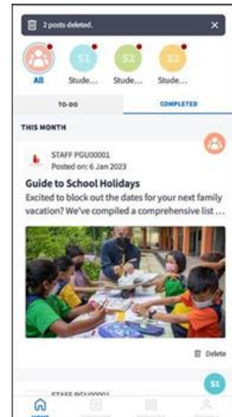
Figure 4 - Deleted posts will be removed from the parent's PG account. It will not be removed from the PG staff web portal