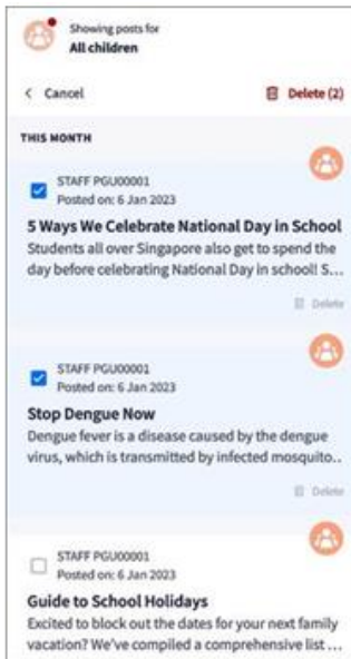
Figure 2 - Parents will be able to select multiple posts for deletion

Parents will be able to select multiple posts for deletion. The posts will be removed from the parents' PG account.